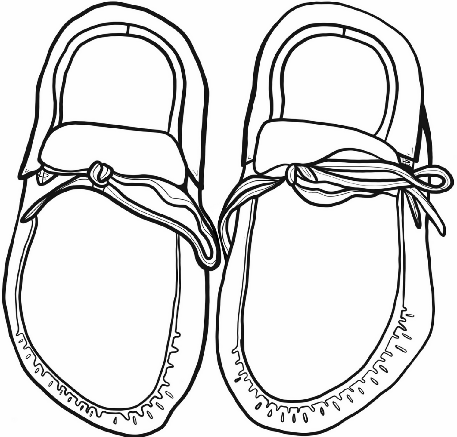
Illustration by Hawlii Pichette

The Native Center will have an art contest for our Native American Students. The contest is to color and design a pair of moccasins. We have provided a template on the next page, or the student can create their own pattern. There will be four winners of a $25 gift card. One winner per grade groups. The groups will be Kindergarten-3rd Grade, 4th grade - 6th grade, 7th grade-9th grade, 10th grade - 12th grade. Deadline to submit to drivas@stocktonusd.net is January 9th at 5pm